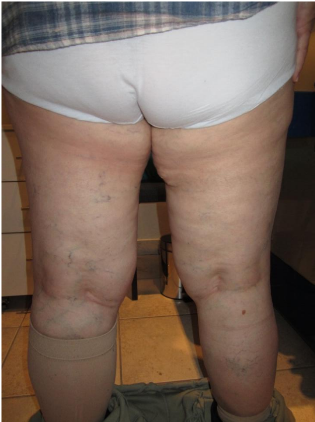
Session 1 - posterior