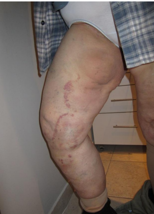
Session 1 - anterior